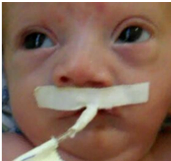
Fig. 1 Dismorphological facial features of newborn with multiple congenital malformations from Central Brazil

The proband was a preterm newborn boy, the first child of non-consanguineous parents, born at 31 weeks gestation to a 44-year old father and a 43-year old mother by cesarean section. At birth, the child weighed 1,480 g, measured 44 cm in crown-to-heel length, and exhibited multiple congenital anomalies. The newborn was transferred to the Intensive Care Units (ICU) immediately after birth. His general health condition deteriorated progressively, leading to his death at 105th days after birth. The newborn had brain malformation, including ventriculomegaly and corpus callosum dysgenesis, cleft lip and palate, retrognathism, hypertelorism, clenched hands with overlapping fingers, and hypotonia. Additionally, he revealed mild heart septal hypertrophy, ambiguous genitalia, enlarged kidneys without corticomedullary differentiation, and gallbladder with tiny cystic formations (Fig. 1). His mother had three miscarriages from previous marriages and one miscarriage with her current husband. The remaining of his family history was otherwise unremarkable.